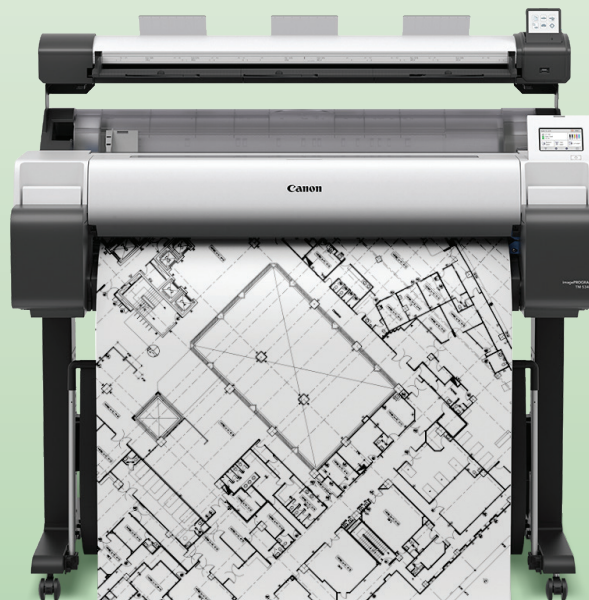
TM-5340 Lm36 Scanner

The TM-5240 and TM-5340 can be utilised alongside a scanner with enhanced capabilities that improve scanning productivity and operability by offering a maximum paper thickness of 0.8mm as well as featuring new transparent guides .