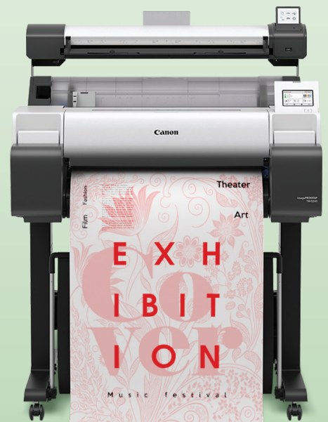
TM-5240 Lm24 Scanner